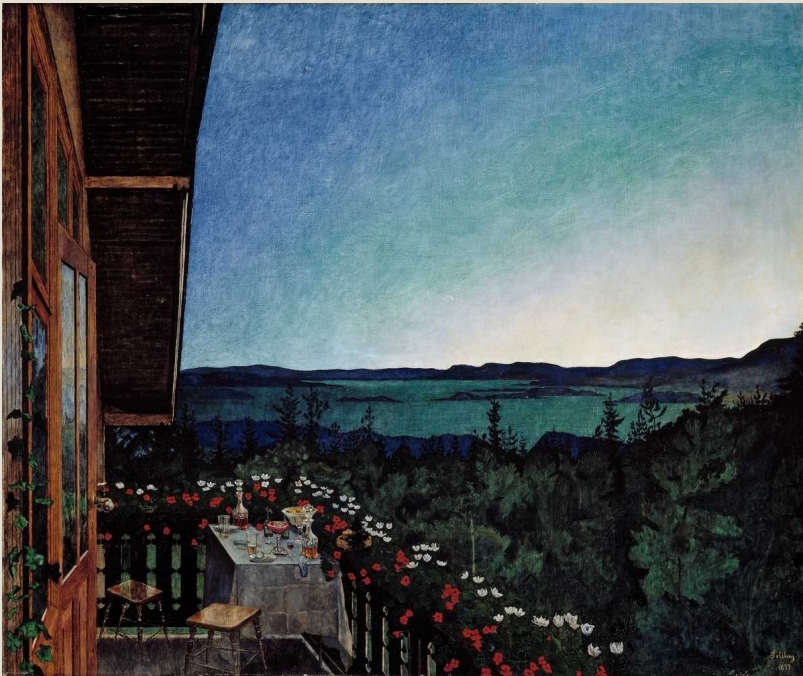
A summer night by Harald Sohlberg